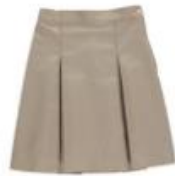
KHAKI 4 KICK PLEATED SKIRT