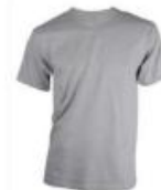
LIGHT STEEL GYM TEE SHIRT W/SILK SCREEN