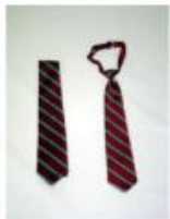
RED NAVY AND SILVER REGIMENTAL STRIPED TIE