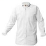
WHITE LONG SLEEVE BUTTONDOWN COLLAR SHIRT W/LOGO