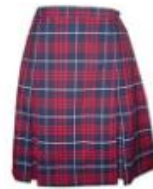
NAVY & RED PLAID 4 KICK PLEATED SKIRT