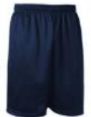
NAVY MICROMESH NYLON GYM SHORTS W/SILK SCREEN