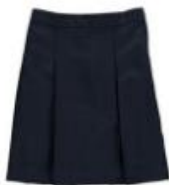
NAVY 100% POLYESTER 4 KICK PLEAT SKIRT