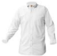
WHITE LONG SLEEVE BUTTONDOWN COLLAR SHIRT W/LOGO